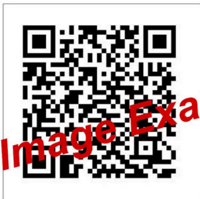
Teddy Smith [3C]

QR Codes can be presented on your phone at walk-up gate and carline, but we prefer you have a placard in your window for car pick up. Placards printed and placed in your window help the car line move faster so that we can see your scholar(s) name to help quickly get your scholar(s) to you. If you do not have a placard you will be required to PARK and present your driver's license in the front office to pick up your child. Starting the first day of school, all individuals picking up students from school must follow these updated procedures.