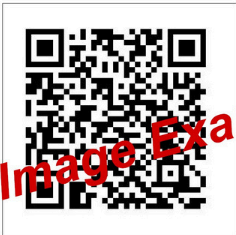
Teddy Smith [3C]

QR Codes can be presented on your phone at walk-up gate only. You must have a placard in your window for car pick up. If you do not have a placard you will be required to PARK and present your driver's license in the front office to pick up your child. Starting the first day of school, all individuals picking up students from school must follow these updated procedures.