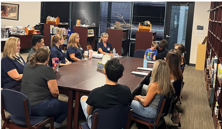
Today's Headmaster Tea with 4th & 5th Grade Parents