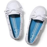
No boat shoes