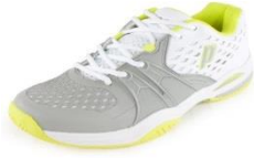
Must be white