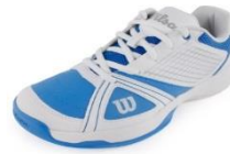
Must be white