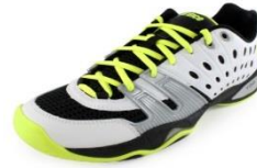
Must be white